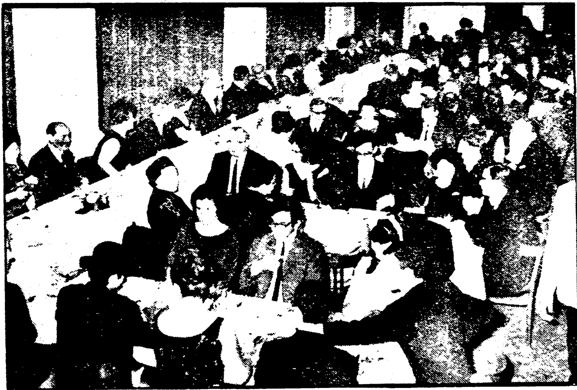
Some of the pharmacists and their guests at the luncheon at the Union Club, Sliema.