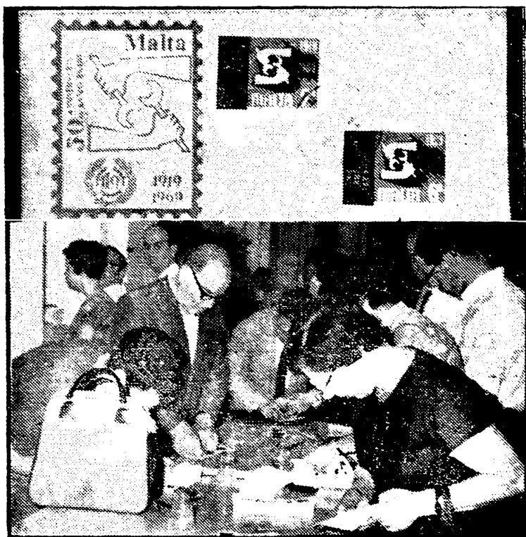
A first-day cover with the new I.L.O. set issued yesterday, with (above) some of the philatelists preparing first-day covers at the General Post Office, Valetta.