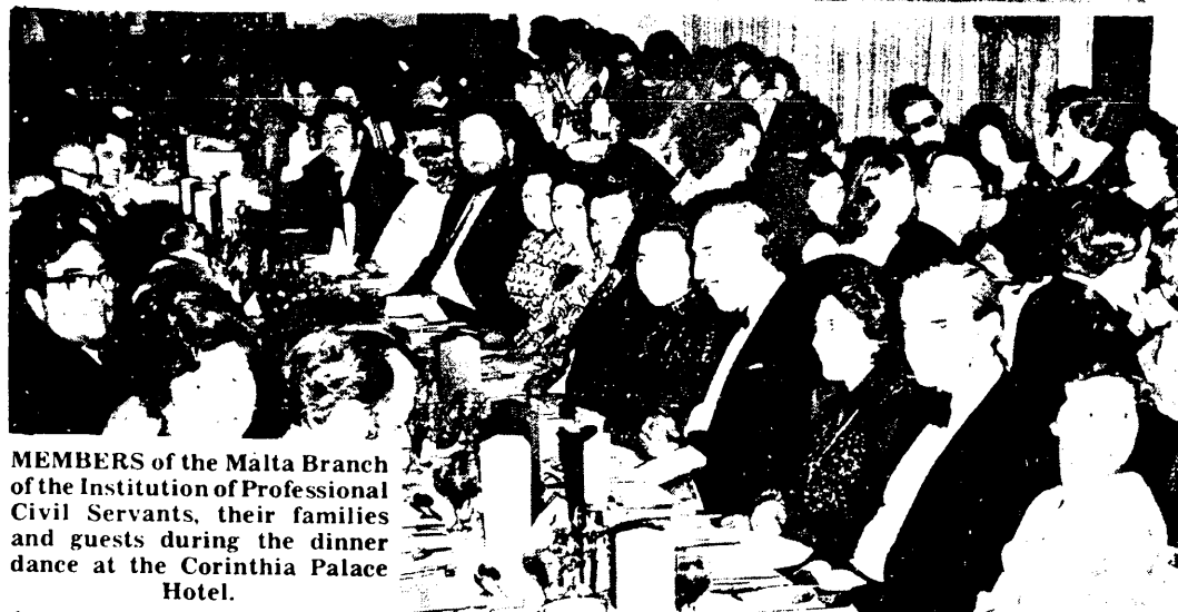
MEMBERS of the Malta Branch of the Institution of Professional Civil Servants, their families and guests during the dinner dance at the Corinthia Palace Hotel.